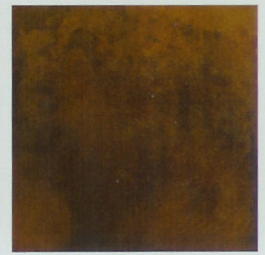
BAS-19 Kona Brown