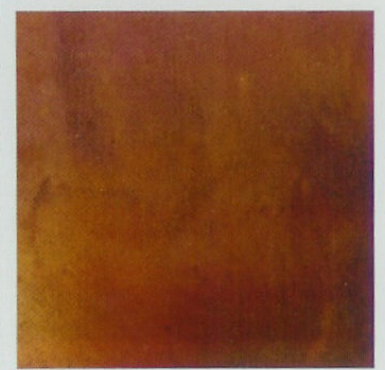
BAS-14 Cordovan Leather