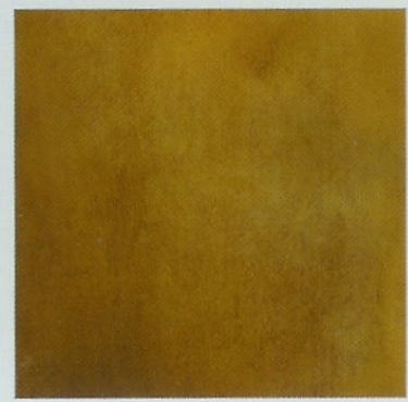
*BAS-18 Weathered Bronze